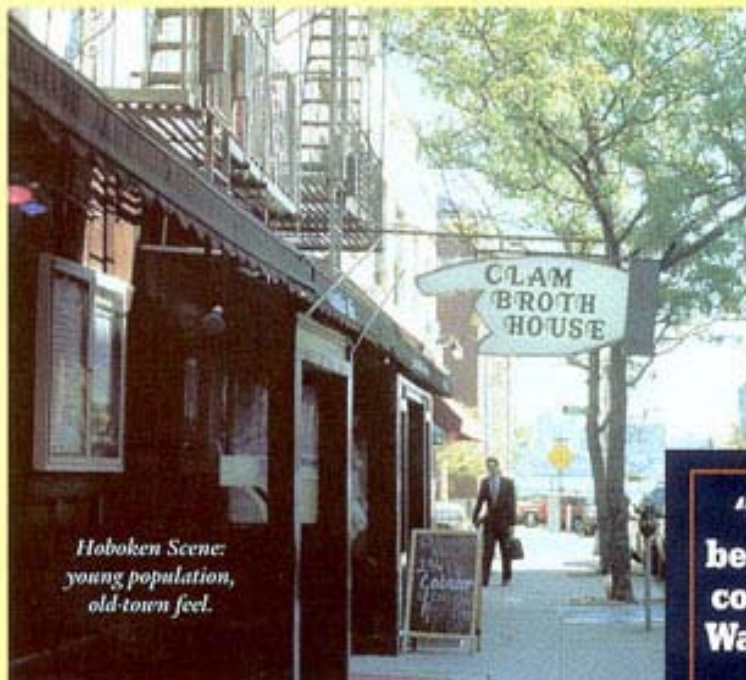
Hoboken Scene: young population, old-town feel.